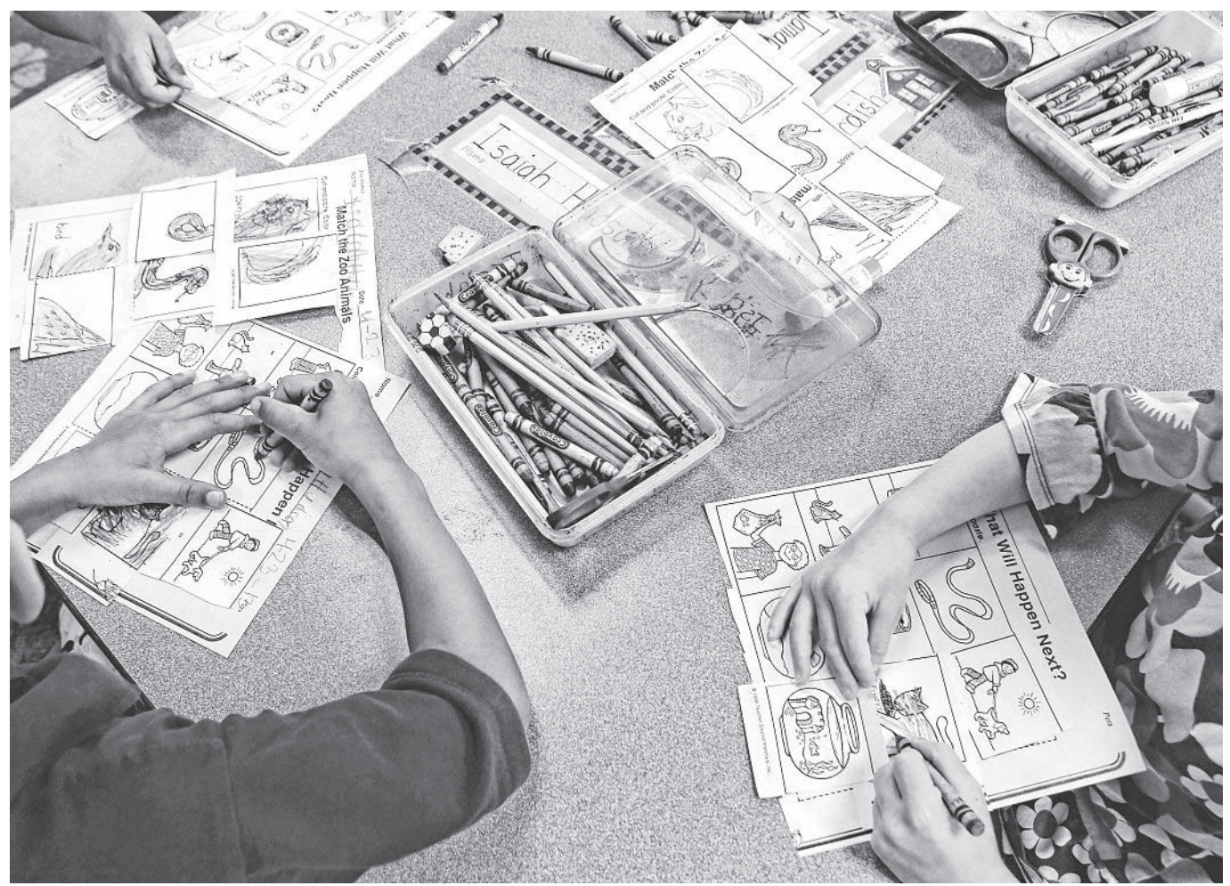
A kindergarten student, left, and a preschool student work on an activity at Riverview East Academy.

for how preschool impacts the rest of the child's life. Students who aren't prepared for kindergarten are less likely to read at grade-level by third grade. Those who don't achieve that milestone, proponents say, are four times more likely to drop out. And dropouts are more likely to be on public assistance and tangled in the criminal justice system. Taxpayers foot the bill.